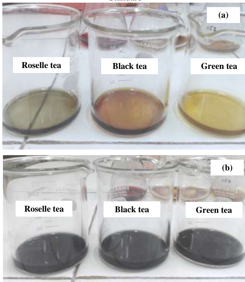
Fig. 2. Green tea, Black tea and Roselle tea before (a) and after (b) the addition of reagents

The results of the calculation of total phenol content in green tea, black tea and Roselle tea samples could be seen on Table 2. The lowest phenolic tea was Roselle tea. Green tea and black tea had similar number of total phenolic about 0.18-0.19%. The precision of phenolic extraction showed in Table 3. Based on Table 3, it could be concluded that maceration using aquadest was the stable method for phenolic extraction of tea because it had %RSD below than 2%.